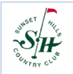
The First Annual Sunset Hills Golf Tournament