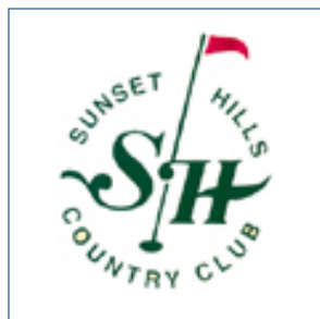
The First Annual Sunset Hills Golf Tournament

For more information, visit www.route66festival.org .